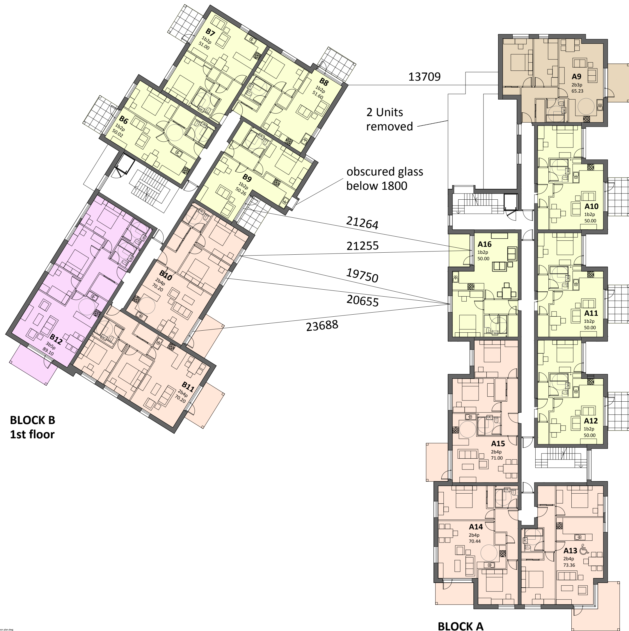
BLOCK B 1st floor